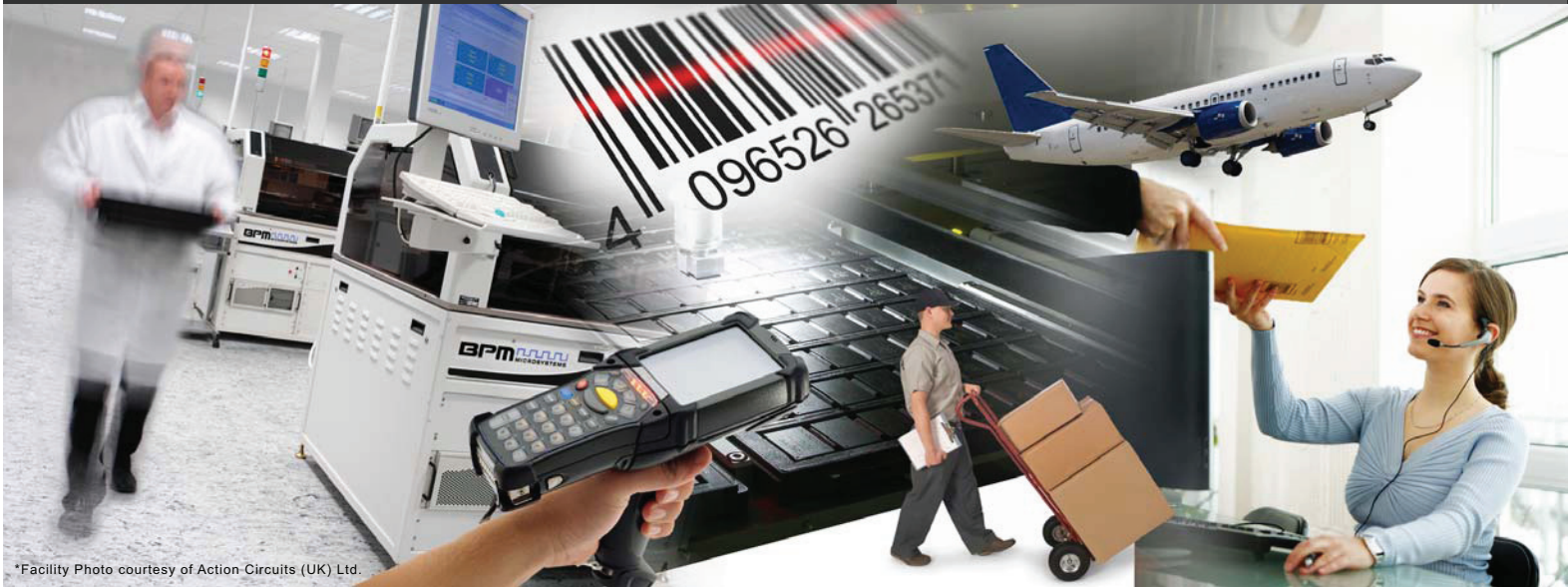
*Facility Photo courtesy of Action-Circuits (UK) Ltd.